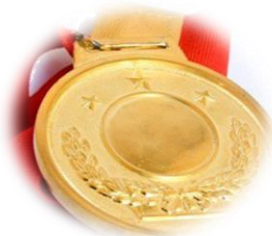
Honors & Awards