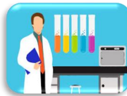
Birth/Citizenship Employment Short stays