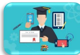
Advance course attending