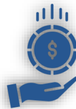
Participation in funded R&D projects