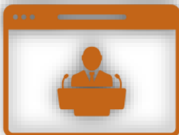
Congress & Conference communications