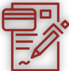
Professional membership & service