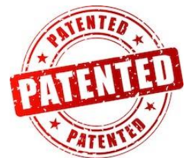
Intellectual properties & Patents